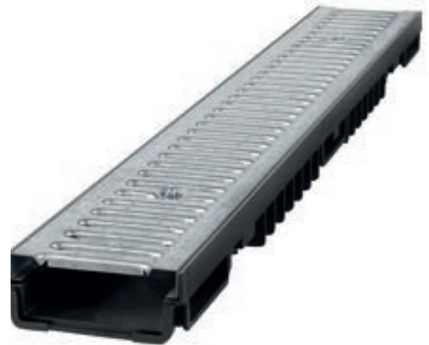
Technical sections of linear drain