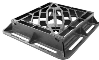
Illustrated: DGHTOD4/4242/KHA DGHTOD6/4242/KHA

Designed and manufactured to exceed the enhanced requirements of Highways England's HA 104/09 specification. The Highway range of access covers and gully grates conforms to BS EN 124 and also includes patented safety provisions and design features to ensure safe and robust performance.