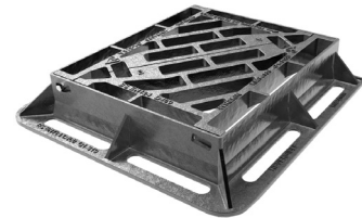
Illustrated: DGHTOD4/4337/KHA DGHTOD6/4337/KHA